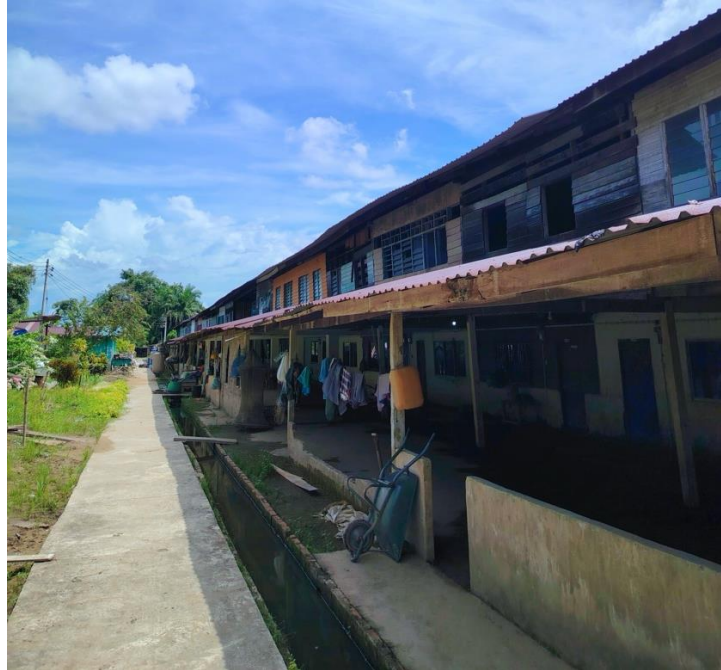
Figure 3. Longhouse structures of the Kiput community in Kuala Tutoh

The Muslim Kiput community in Benawa inhabited individual family houses organised within a village settlement pattern and engaged in daily Islamic prayer practices conducted in Arabic, supplemented by Qur'anic study groups and religious instruction for younger community members. Islamic religious calendars, including Ramadan observances and Eid celebrations, structured community ritual life and household economic activities. Gender relations within Muslim Kiput households appeared to reflect Islamic interpretations of gender roles, with women's work patterns and household responsibilities manifesting distinctive characteristics relative to Christian Kiput communities. However, women in both communities maintained significant responsibilities for agricultural production, craft creation, and managing household finances.