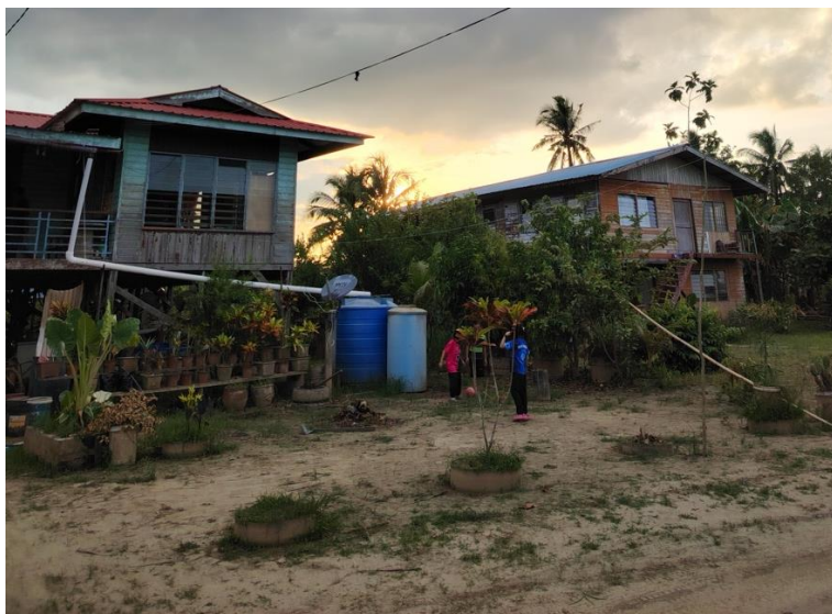
Figure 4. Individual houses of Kiput community in Kg Benawa

Analytically, this suggests that religion acts as a differentiating internal boundary but not a dividing ethnic boundary. It shapes how Kiput people organise social life, but it does not determine who counts as Kiput. Such patterns resonate with theoretical models of “plural identities” in Indigenous societies where ethnic and religious identities overlap without collapsing into a single hierarchy. The Kiput case, therefore, illustrates how minority groups integrate world religions while maintaining ethnic cohesion.