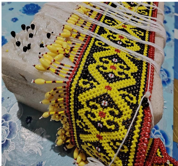
Figure 2. Example of Kiput community beadwork from Kuala Tutoh

However, ethnographic observation indicated that younger generation members (ages 15–30) demonstrated weakened engagement with ethnic identity markers relative to older community members. Limited competence in the Kiput language, reduced participation in traditional craft production, and expressed aspirations for educational advancement and urban employment suggested that contemporary youth navigated their ethnic identity in complex and contested ways. Rather than simply rejecting Kiput identity, younger generation members appeared to be negotiating selective engagement with ethnic markers whilst simultaneously constructing identities as educated, modern subjects positioned for participation in Sarawak's formal economy. This pattern aligns with broader research that documents how indigenous youth in Southeast Asia construct hybrid identities, incorporating both ethnic heritage connections and aspirations for contemporary modernity (King, 2016).